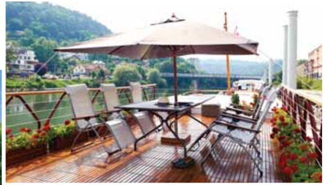
ABOVE: THE AFLOAT IN FRANCE FLEET CONSISTS OF TRADITIONAL DUTCH BARGES OUTFITTED WITH TOP-OF-THE-LINE AMENITIES. TOP RIGHT: SETTING UP FOR AN AFTERNOON OF WINE AND CHEESE ATOP THE BARGE.

fourteenth-century Château de Germolles, the former home of the Dukes of Burgundy, as well as the circa-1443 Hôtel-Dieu de Beaune, a museum and former charity hospital that remains one of the foremost examples of French fifteenth-century architecture.