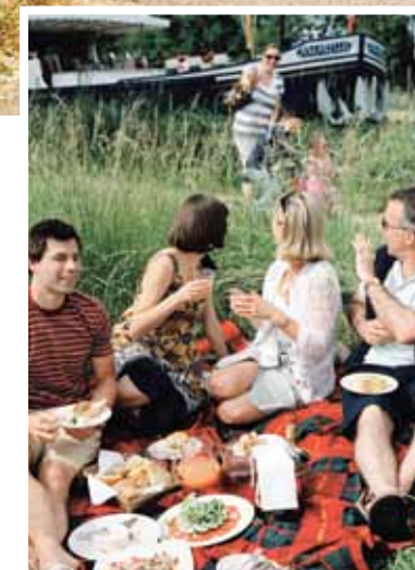
TOP: THE AMARYLLIS FLOATING GRACEFULLY THROUGH BURGUNDY'S NARROW INLAND WATERWAYS. ABOVE: AN AFTER-NOON BARGE-SIDE PICNIC FILLED WITH FRENCH CULINARY DELIGHTS.

In between unapologetically eating, drinking and relaxing on the barge, travelers participate in daily excursions. Beyond absorbing the local vibe through guided walks and personal ambles into rural towns, look forward to visiting magnificent sites such as the