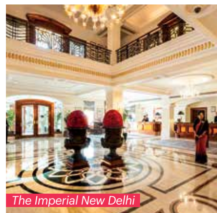
The Imperial New Delhi