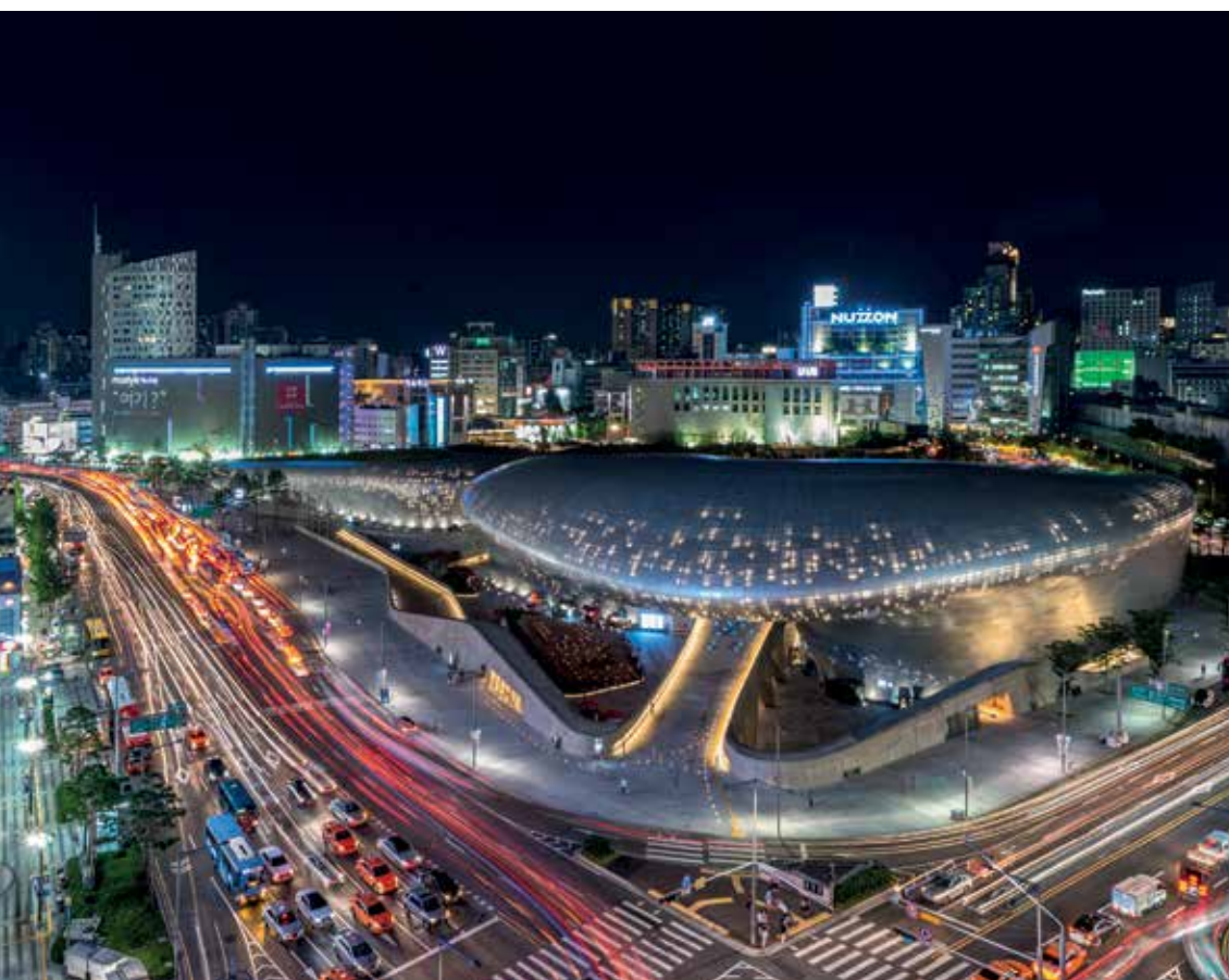
Above: Modern Tokyo features futuristic architecture. Left: Previously off the tourist trail, Seoul promises enchantment and authentic experiences

I've also seen Lima, Peru, emerge as a capital of gastronomy, warranting long-distance travel anchored solely by the prospect of incredible food. To say Lima's food scene is great wouldn't be doing it justice; it's downright phenomenal. This foodie revolution has also catalyzed a citywide renaissance that's branded Lima a true destination, not just a layover en route to Cusco and the Sacred Valley.