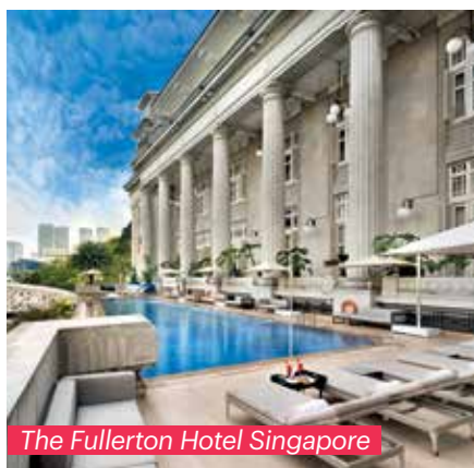
The Fullerton Hotel Singapore