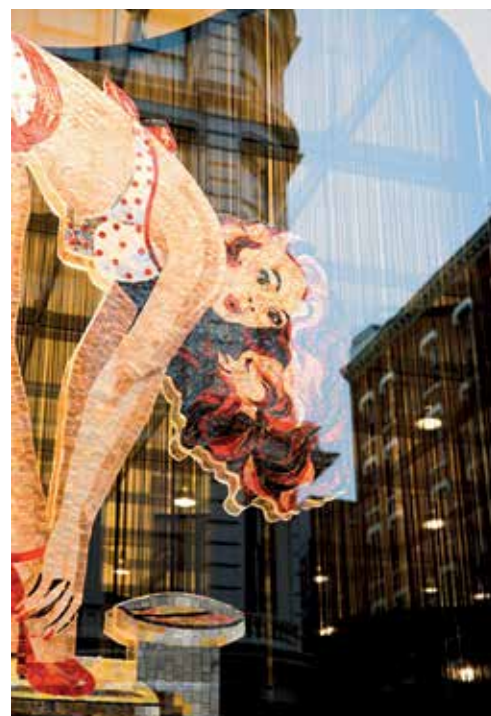
Left: The sun reflects off the spectacular New York skyline

Maybe that's why I am so eager to explore the extremes of Earth's other great cities. No city break has been more life affirming than a recent trip to Tokyo, Japan, where I ventured far beyond my comfort zone – and loved every second of it.