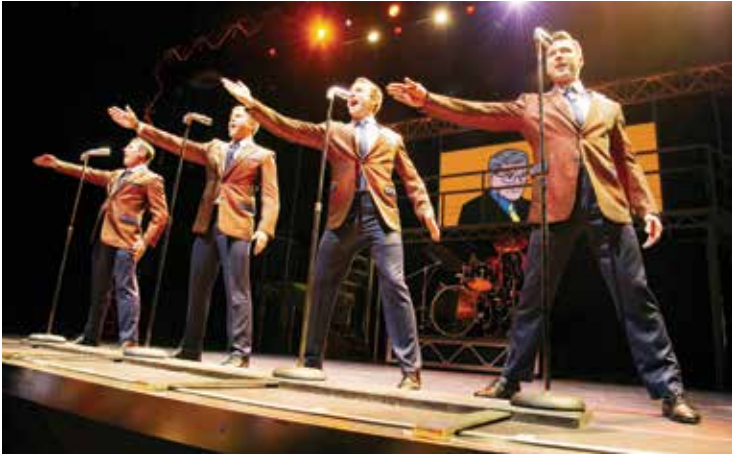
START THE EVENING WITH A MOJITO AND LATIN MUSIC AT SUGARCANE BEFORE HEADING TO A PRODUCTION OF THE MUSICAL JERSEY BOYS .

Shows vary by vessel but expect veritable productions of Tony Award-winning Broadway shows Jersey Boys and Kinky Boots , with the best seats in the house reserved for Haven guests, no less.