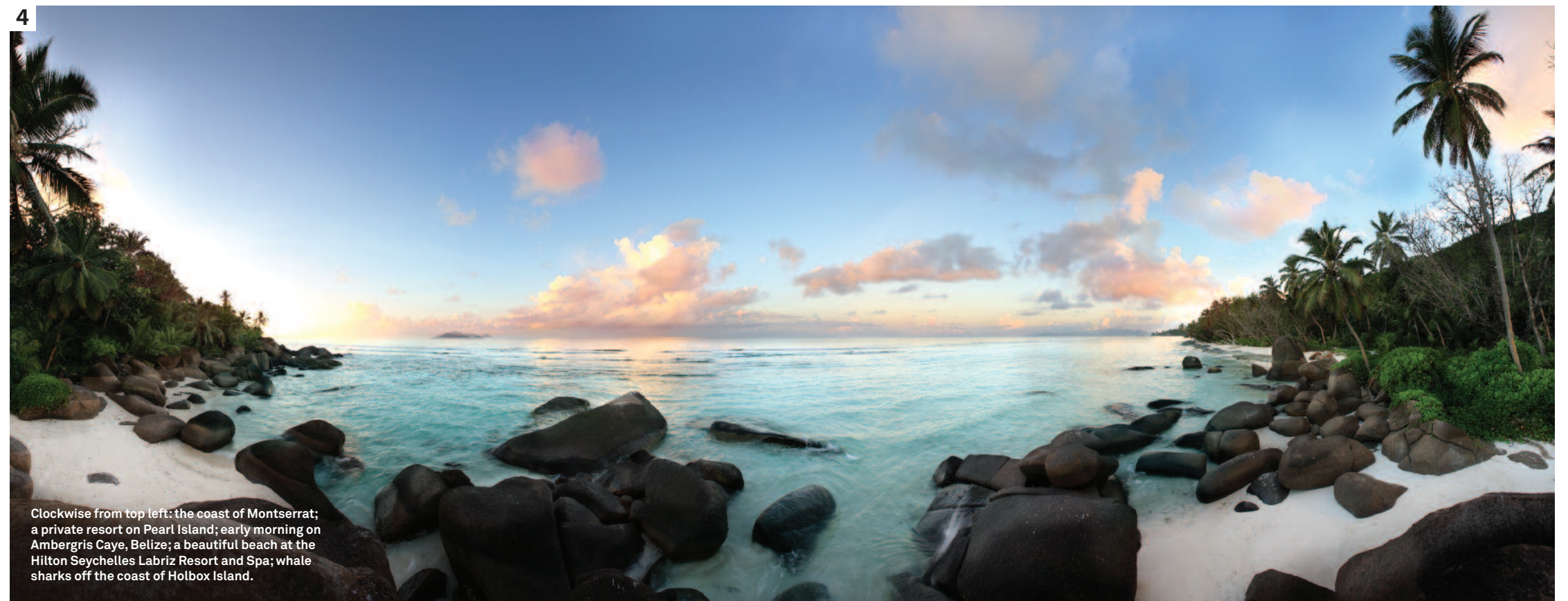
Clockwise from top left: the coast of Montserrat; a private resort on Pearl Island; early morning on Ambergris Caye, Belize; a beautiful beach at the Hilton Seychelles Labriz Resort and Spa; whale sharks off the coast of Holbox Island.