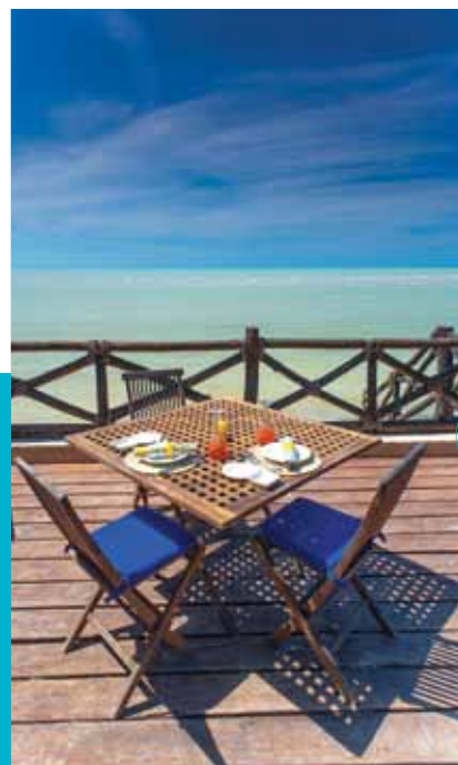
MEDITATE ON THE BEACH BEFORE RETREATING TO YOUR SUITE AT THE CASA SANDRA (ABOVE AND LEFT) OR ENJOY BREAKFAST ALFRESCO AT LAS NUBES DE HOLBOX (RIGHT).