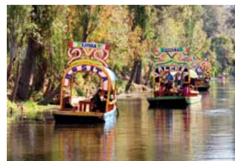
EXPLORE TEOTIHUACÁN (ABOVE) AND VIEW DECORATIVE TRAJINERAS ALONG THE CANALS OF XOCHIMILCO (LEFT).

figurines, and sculptures to show adoration for the afterlife. Flowery, oversize Mexican gondolas, known as trajineras , float young lovers and festive groups along the canals of Xochimilco. The boutiques, galleries, bistros, and cafés of chic districts like La Condesa, La Roma, and Polanco buzz with the country's growing bourgeoisie.