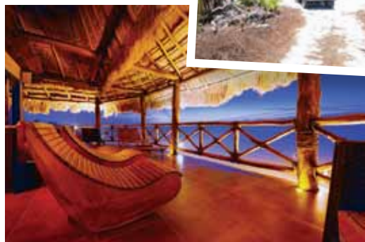
AT LAS NUBES DE HOLBOX, YOU'RE NEVER FAR FROM THE OCEAN.

Influenced by the region's architectural customs, the Rosewood San Miguel de Allende ( rosewoodhotels.com/en/sanmigueldeallende ) was built like a traditional Mexican hacienda , with expansive rooms that surround either a central courtyard or aromatic fields of lavender. Arched domes lead from one building to the next, each corridor lined with art and ending at a different modern marvel. Pick a direction and discover a cabana-lined infinity pool, or a wine cellar dedicated to artist Frida Kahlo and constructed from