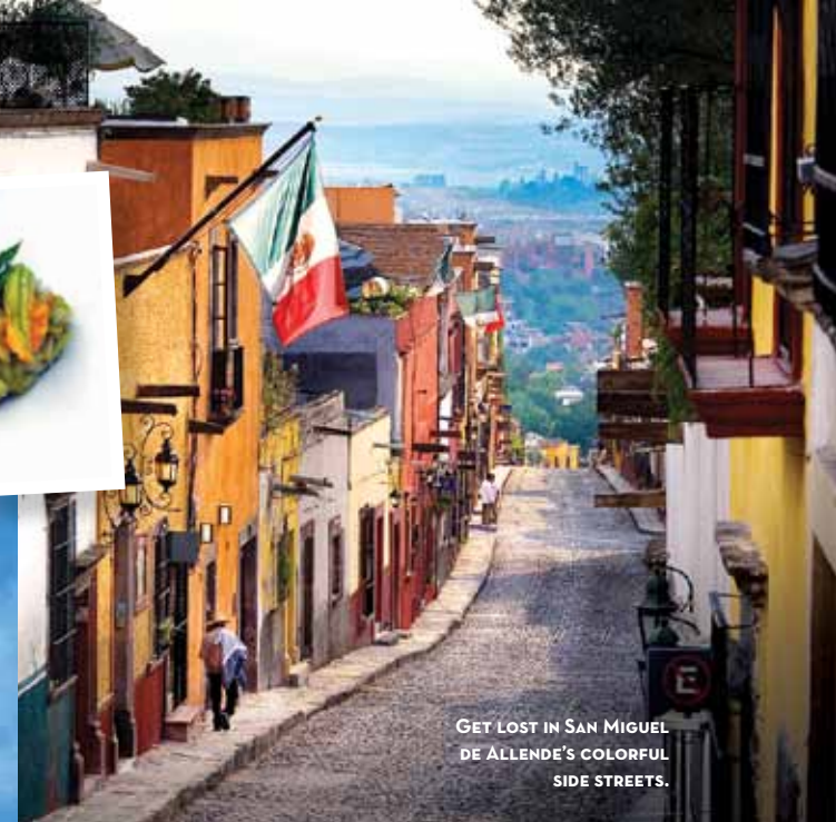
GET LOST IN SAN MIGUEL DE ALLENDE'S COLORFUL SIDE STREETS.

The rogue city that helped launch the Mexican War of Independence is now making history as the country's most glamorous destination. San Miguel de Allende, an eighteenth-century colonial town in the heart of Mexico's central highlands, sparkles with UNESCO World Heritage grandeur, captured in its colorful streets, stunning gardens, neoclassical monuments, neo-gothic churches, and ba-