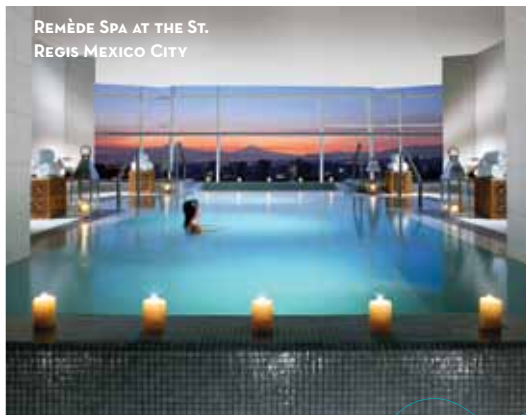
REMÈDE SPA AT THE ST. REGIS MEXICO CITY

Las Nubes de Holbox ( lasnubesdeholbox.com ), where the upstairs master suites grant the best ocean views and superlative flamingo encounters. Slightly closer to "town," the 12-room Casa Sandra ( casasandra.com ) champions a delightful barefoot sophistication without tarnishing the old-school Mexican bucolic charm. Its exterior showcases iconic Mexican architecture, with whitewashed walls and a thatched-palapa roof, but its interiors, clad in hand-embroidered pillows and tapestries, imbue this paradisiacal boutique hotel with a familiar tinge of luxury.