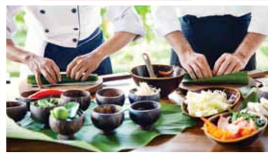
THE COOKING SCHOOL (BELOW) AND PRINCIPAL SWIMMING POOL (RIGHT) AT UMA UBUD; A 2-BEDROOM RETREAT VILLA (RIGHT) AT COMO SHAMBHALA.

Navigating this shoreline feels like a journey back in time. Women stroll along roadsides, balancing buckets of salak (snake fruit) on their heads, and children weave delicate floral arrangements called banten canang as religious offerings for life-cycle ceremonies. The colors, smiles and sounds are vibrantly expressive. Many of these traditional scenes stem from the Balinese devotion to their own version of Hinduism— Agama Hindu Dharma . This fidelity has resulted in an island known for “1,000 temples” (though there are likely more), none more important than the eleventh-century Mother Temple of Besakih, the inspiration