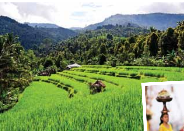
SCENES FROM RURAL BALI, CLOCKWISE FROM ABOVE: RICE PADDIES; WOMEN STROLL ALONG ROADSIDES, BALANCING BUCKETS OF FRUIT ON THEIR HEADS; THE TEMPLE OF BESAKIH.