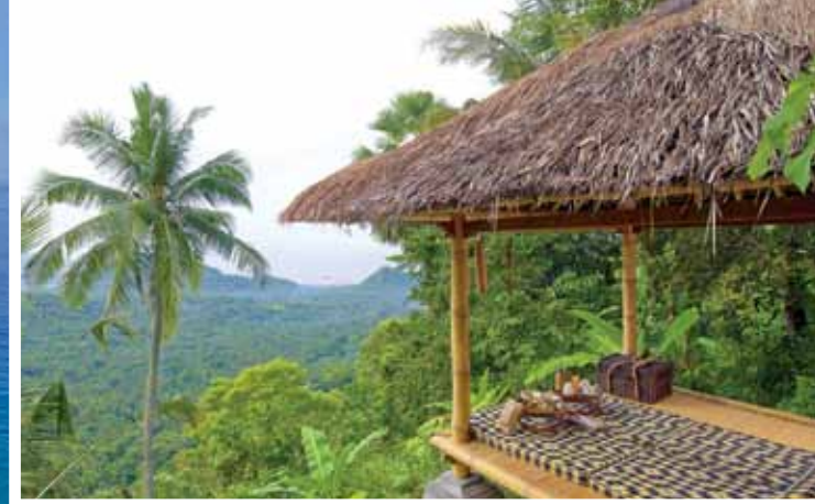
SCENES AT AMANKILA, COUNTER-CLOCKWISE FROM TOP: A ROMANTIC HILLTOP DAYBED; THE STUNNING, THREE-TIERED, CLIFFSIDE POOL; THE BEACH CLUB.