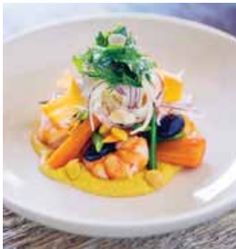
ALFRESCO DINING AND HEART-HEALTHY MEALS, LIKE THIS TIGER PRAWN, BABY CARROT AND BABY BEAN SALAD (LEFT), ARE PART OF THE COMO SHAMBHALA EXPERIENCE.

customs of generations past. Farther afield, the COMO Shambhala Estate ( comohotels.com/comoshambhalaestate ) is the evergreen of Ubud inspiration and enlightenment. In addition to private villas, rooms and suites, accommodations include five luxury residences and five retreat villas, each with motifs like fire, water and Earth reflected in high design.